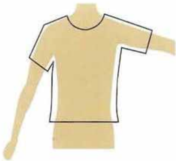
MENS MODERN FIT

Shaped to the body. Get a semi-fitted look by buying one size up.