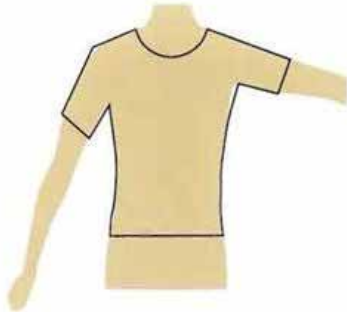
MENS SLIM FIT