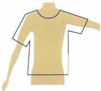
MENS EASY FIT

Follows the shape of the body with ease added for movement.