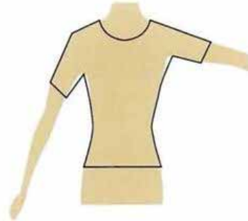
LADIES SLIM FIT

Shaped to the body. Get a semi-fitted look by buying one size up.